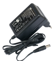
24V 0.8A power adapter